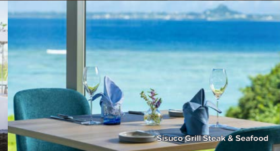
Sisuco Grill Steak & Seafood