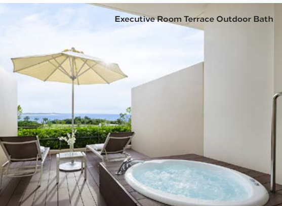
Executive Room Terrace Outdoor Bath