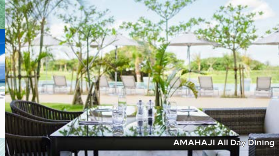
AMAHAJI All Day Dining