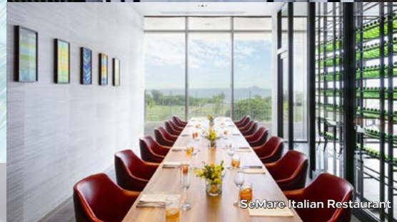
SeMare Italian Restaurant